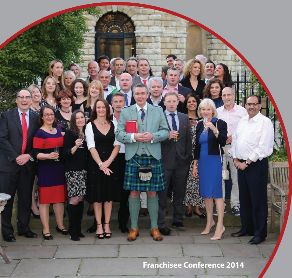
Franchisee Conference 2014

Click here NOW to find out more about running a successful AngloINFO business in your region